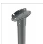
Pole connection B LKITA000000401 09