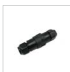
Fast connector IP 3 poles LKITA00000000003