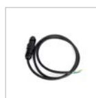
Cable with connector Ca. 2m/Co. IP 2 poli LKITA00000000040 Ca. 2m/Co. IP 3 poli LKITA00000000041